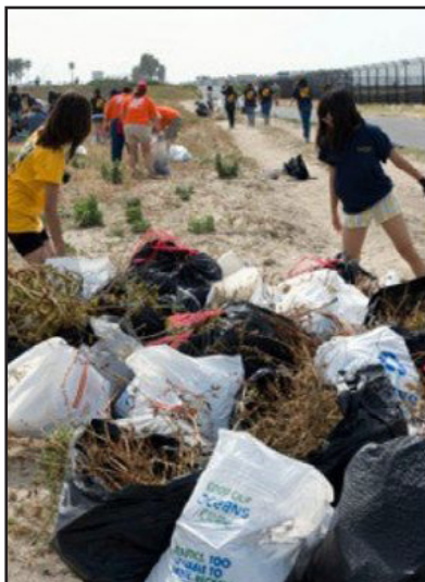
Some of the 600 volunteers pick up trash during the Care for our Coast campaign’s Earth Day Clean-up, Saturday, April 17 at Huntington Beach State Park.

The program was sponsored by Stater Bros. Markets, the Coca-Cola Bottling Company of Southern California and California State Parks to raise funds for beach clean-up, dune restoration, recycling and maintenance along the California coastline.